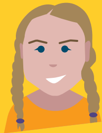
GRETA THUNBERG LEADER

Greta Thunberg is a Swedish teenager and activist. She has demanded action from world leaders to do more to protect the environment and encouraged many people around the world to take part in protests.