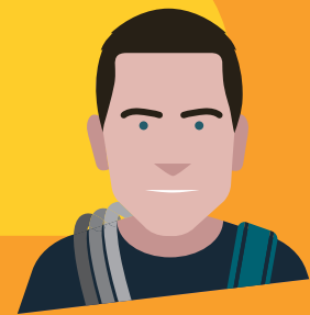
BEAR GRYLLS PRACTICAL