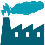
Fossil Fuel Oil